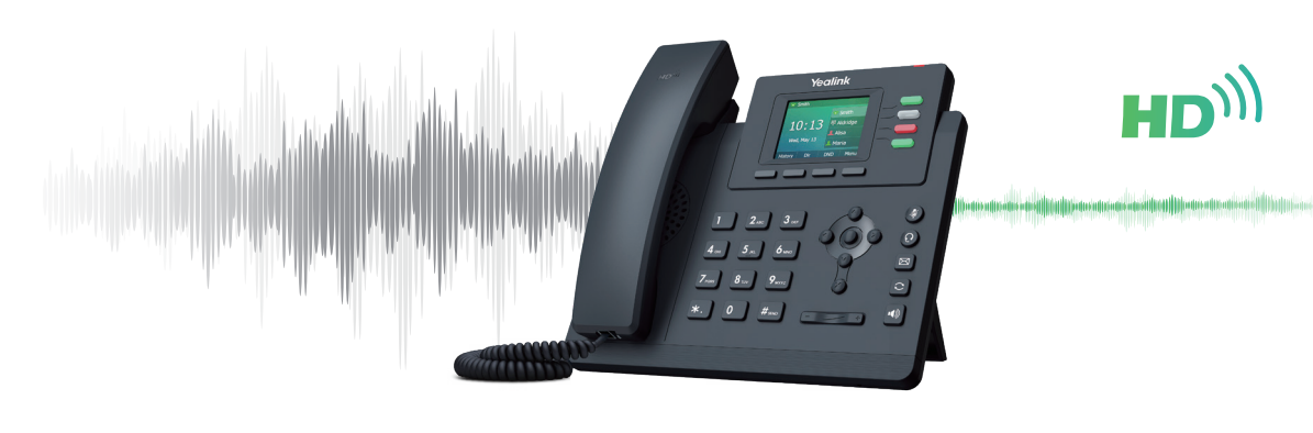
Smart Noise Filtering

The Yealink T3 series provides distraction-free communications with industry leading Smart Noise Filtering Technology, which delivers excellent sound quality without extraneous noises and allows fluent conversations.