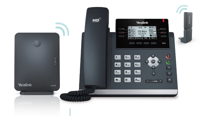
Easy Deployment without Wired LAN